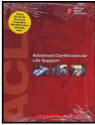
ADVANCED CARDIOVASCULAR LIFE ISBN: 9781616690106